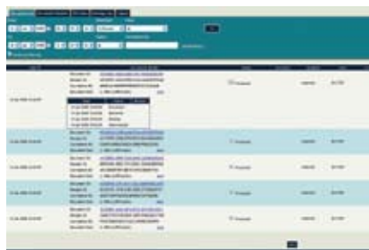
Improved manageability and usability is standard in DIS 2.0